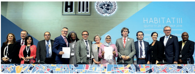
Second panel on the local and regional governments' commitments