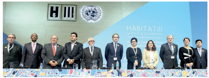
Third panel on the local and regional governments' commitments