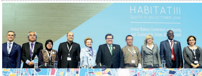
Panel on local and regional governments' response to the New Urban Agenda