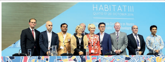
First panel on the local and regional governments' commitments